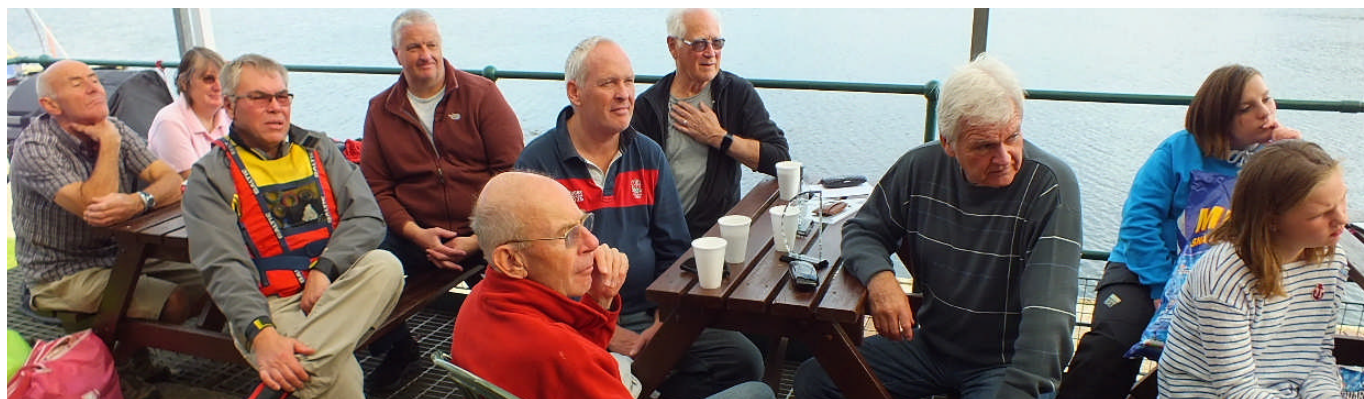
Racing is as much about winning as it is about meeting friends for a drink and a chat, like here at the prize-giving of the Flying 15 Open Meeting 2018.