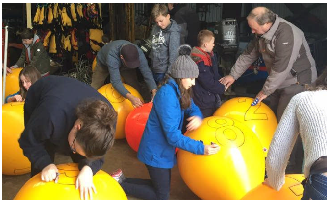
Thanks for these three lovely pictures, Julia!

PS - Gary Curtis is looking for extra crews for the Beaver, so that weed-cutting can continue during the vital weed growing season. No previous experience necessary - you will receive full training. Cutting is done whenever crews are available and if you can spare time during the week, that would be great!