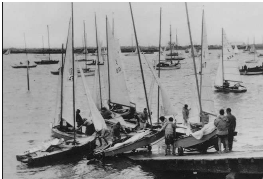
Above: The Certificate of Crossing from 1956.