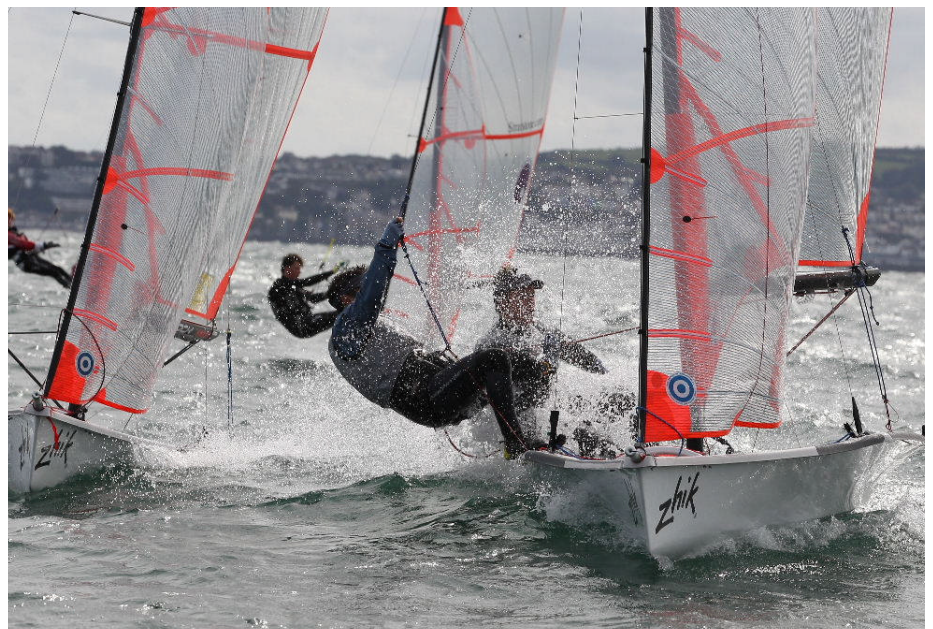
A strong breeze with 20 knots wind, gusting 35.

Detailed results can be found at: www.ullswateryachtclub.org