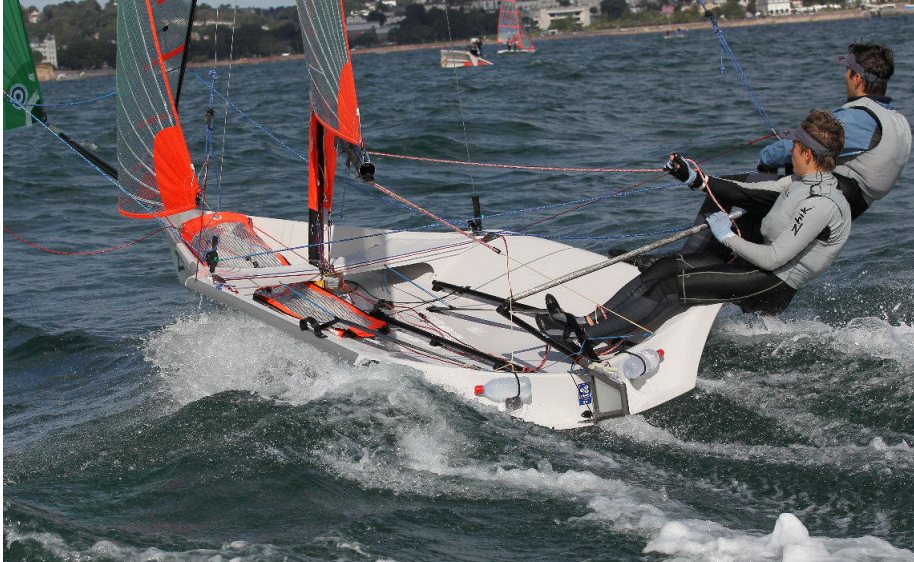
2117 going full steam ahead.

A mixed start at the 29er Grand Prix at Ullswater Yacht Club after training for half an hour before the first race, we ended up leading round the windward mark to finish 3rd. However, after a reasonable first beat for the second race, close sailing resulted in Matt being harpooned out of the boat by a long carbon fibre pole, which ended up with an angry crew and the boat turtling, so that used up our discard. We then followed up the day with a 6th and a 8th, also getting involved in a protest and winning ;)