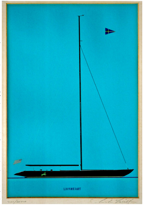
Lionheart was to be the British Americas Cup Challenger in the 1980s.